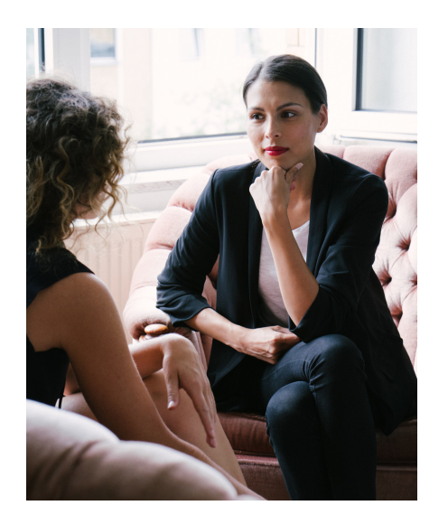
POWERFUL COACHING Learn to coach for life-changing results with

Core Elements That Deliver Our Comprehensive Program for Optimal Personal & Professional Transformation