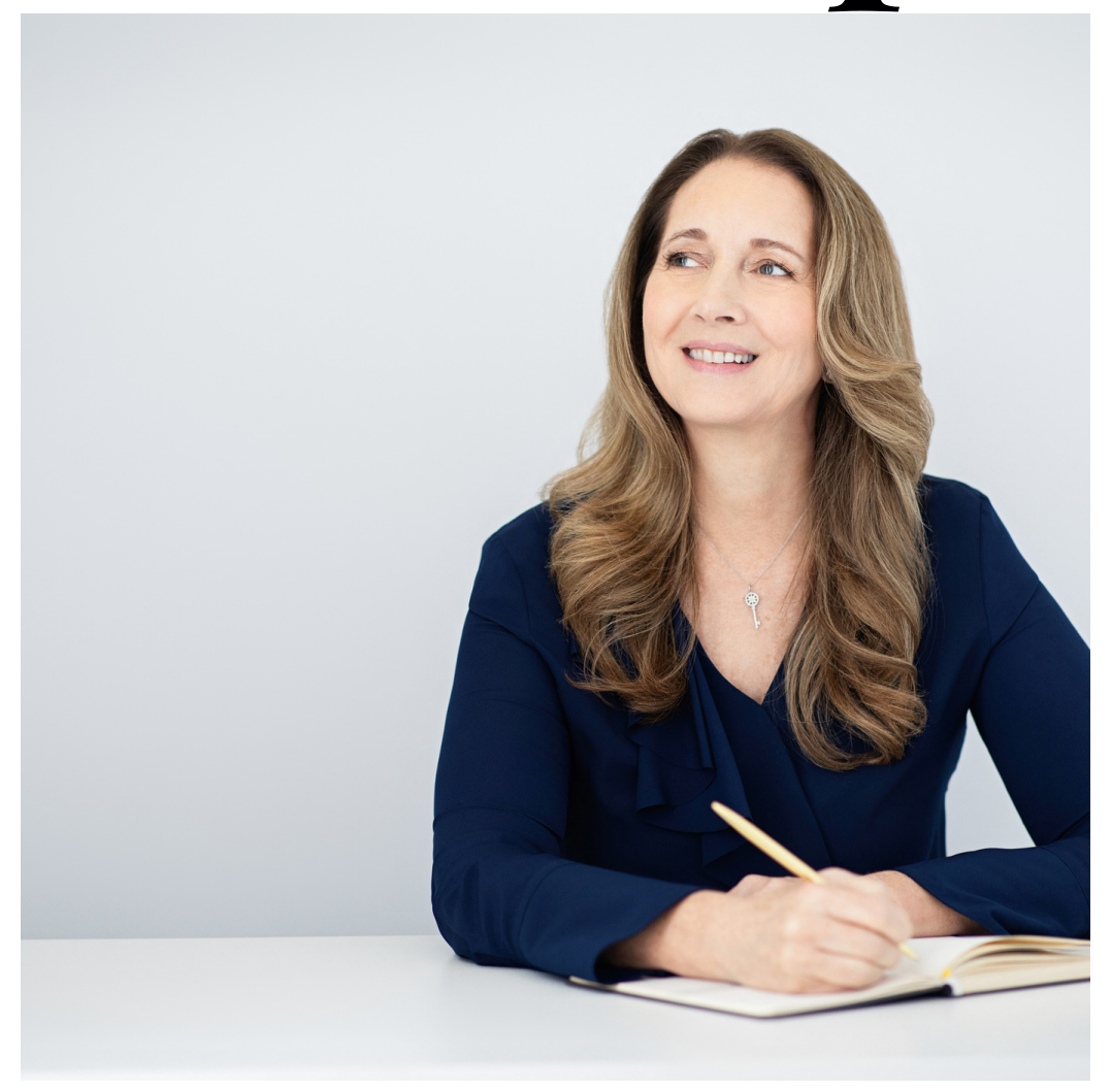
DISCOVER YOUR PURPOSE AS A LIFE COACH

We are now enrolling for our next Jungian Life Coach Training cohort. Schedule your free 15-minute call with Admissions for your chance to speak with an Enrollment Coach and discover if this remarkable training is the right fit for you.