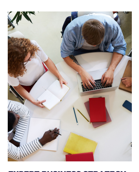
EXPERT BUSINESS STRATEGY Launch and grow your coaching business with expert strategy and guidance