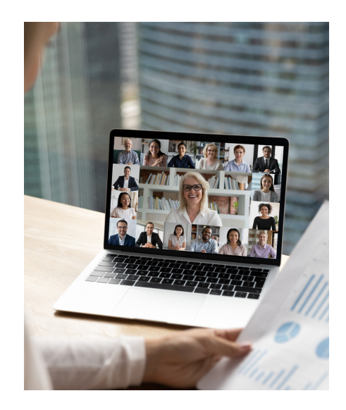
ONGOING SUPPORT Receive ongoing support in an elevated online 24-7 community