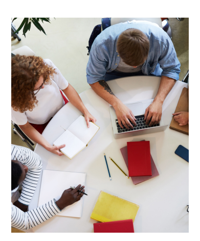
EXPERT BUSINESS STRATEGY

Launch and grow your coaching business with expert strategy and guidance